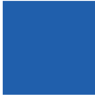
Blue No.205fac CMYK Breakdown C89/M61/Y0/K0

The colours should be used wherever possible. However, for mono situations, two separate variants of black.