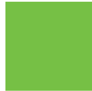
Green No.76c045 CMYK Breakdown C59/M0/Y87/K0