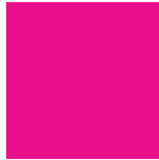
Magenta No.e90f8a CMYK Breakdown C3/M94/Y0/K0